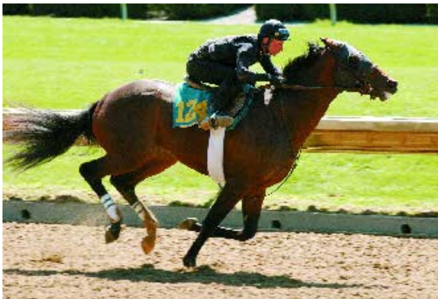
This Pulpit—In My Cap colt was bought for $170,000 and re-sold for $3.3 million

"Plus, he knows sire lines, dam lines, pedigrees. He knows what horses are supposed to look like. When he looks at a weanling, he knows if the dam is like that, if the sire is like that. He can put the pieces of the jigsaw puzzle together. That doesn't mean he gets it right all the time—no one does. But the success he's had and we've