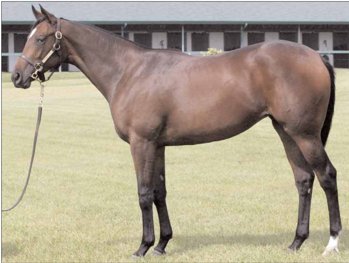
Fantastic Light/Sahibah 2003 dark bay or brown filly